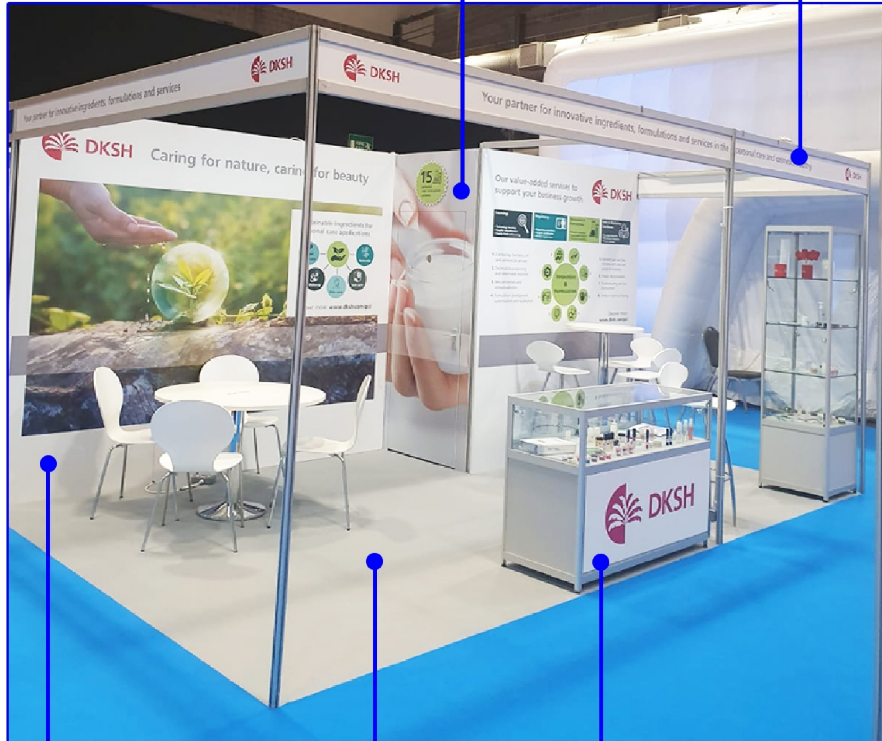
THE STAND WALLS... OF COURSE