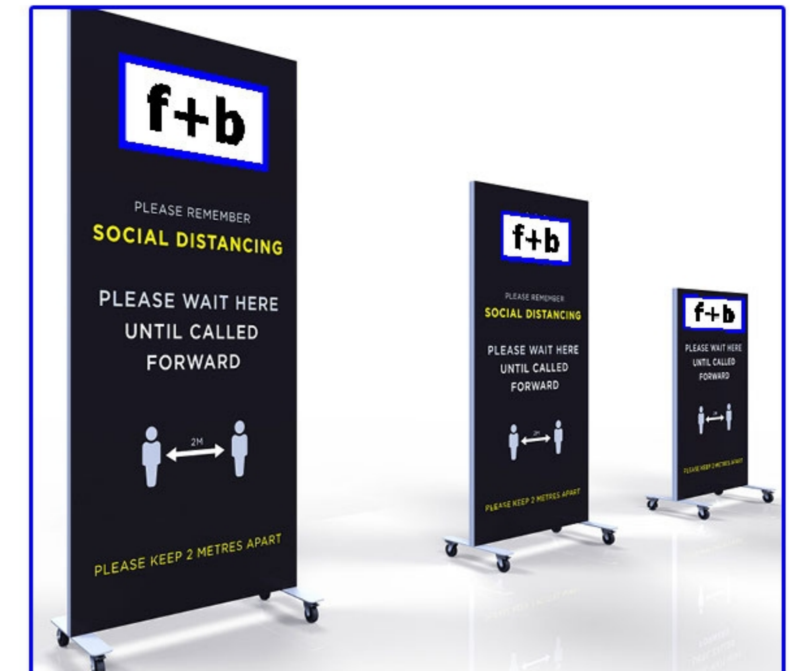
FABRIC SIGNAGE - FREESTANDING OR ON WHEELED CASTORS