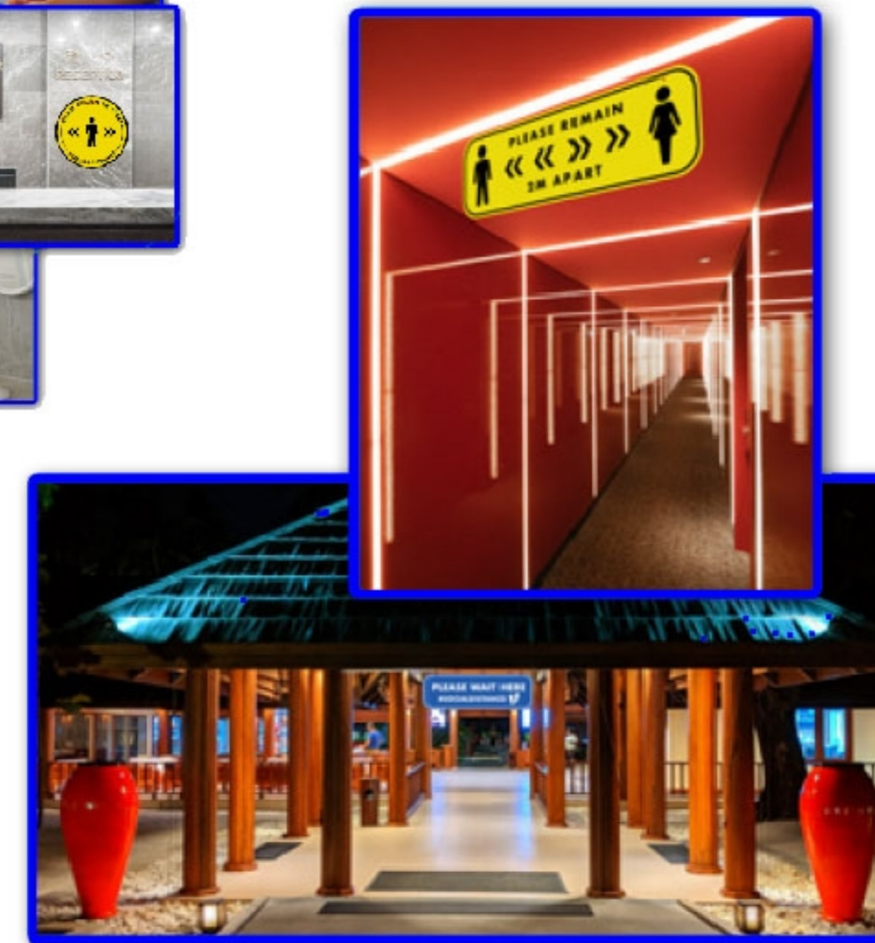
INTERNAL AND EXTERNAL SOFT BANNERS OR SOLID SIGNS (ANY CONTENT)